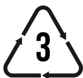
PVC MONOMERIC 3 YEARS